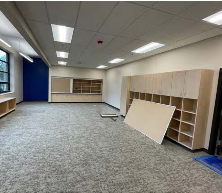
BUILDING ADDITION CLASSROOM IN FINAL STAGES OF CONSTRUCTION