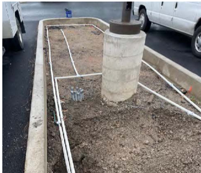
IRRIGATION AND LANDSCAPE PROGRESS