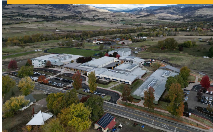
COMBINED ASHLAND MIDDLE SCHOOL AND TRAILS OUTDOOR SCHOOL CAMPUS

In January, the Ashland High School moved ahead with the renovation project by accepting proposals for Construction Manager|General Contractor (CMGC). Walker Elementary made great strides in progress towards achieving project completion in April. The Bellview Elementary HVAC project kicked off now that a contractor has been awarded the construction contract. The Solar project is moving ahead with an anticipated bidding window of late spring.