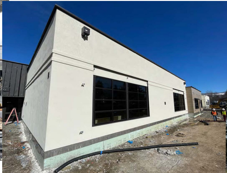
EXTERIOR CEMBRIT CLADDING AND NEW STUCCO ON THE SOUTH SIDE OF THE BUILDING