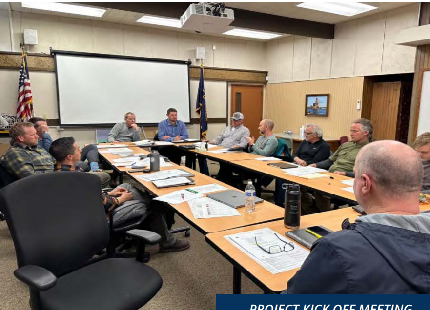
PROJECT KICK OFF MEETING

The month of February was exciting in the fact that the District interviewed, selected and the School Board approved the hire of a Construction Manager|General Contractor (CM|GC) for the project. The joint venture of Kirby Nagelhout Construction Company (KNCC) and Outlier Construction Company (Outlier) was selected to join the team. Next steps will be to sit down and strategize the most effective method to complete the project. In addition to the CM|GC selection, the replacement stairs for the Science building are being fabricated in preparation for a summer installation.