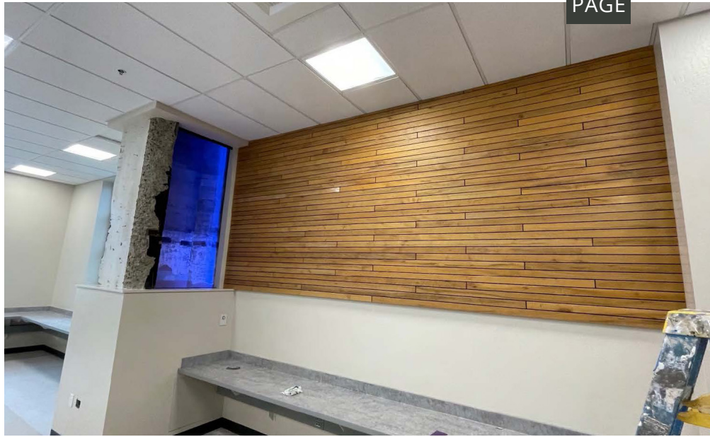
WALKER ELEMENTARY COMPUTER LAB WITH STATE HISTORIC PRESERVATION OFFICE (SHPO) DISPLAY

Final portions of site work and landscaping are rapidly progressing throughout the campus. The renovated portion of the building interior is complete and finish work is wrapping up in the addition. The new stainless steel kitchen equipment has been installed and is undergoing testing. The buildings HVAC system is in the commissioning process, ensuring proper function of all components.