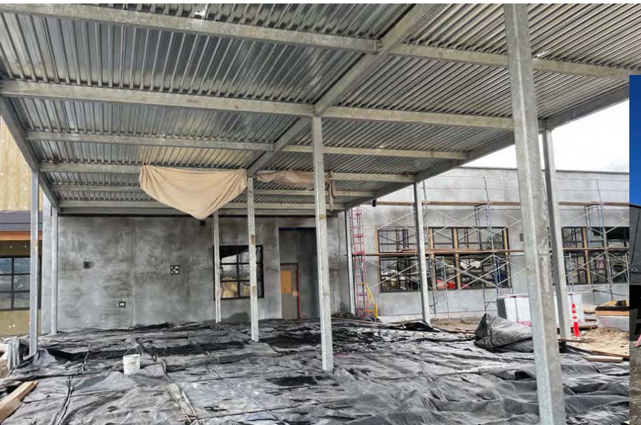
COVERED BIKE CANOPY IN COURTYARD

Classrooms in the renovated building are in the final stages of construction, with finishes complete including floor coverings, ceiling tiles, lighting, and casework. The addition is close behind with the major focus being trim out of electrical and plumbing as well as installation of casework and floor coverings. Testing and balancing of the HVAC system is scheduled in the coming week, which is an important step in the building commissioning process. Weather has slowed exterior finishes, but progress remains apparent with installation of the first section of Cembrit cladding. Final sections of concrete flatwork are tying sectors of the exterior areas together, which further defines landscaped areas and illustrates the architect's intended routes for navigating the site.