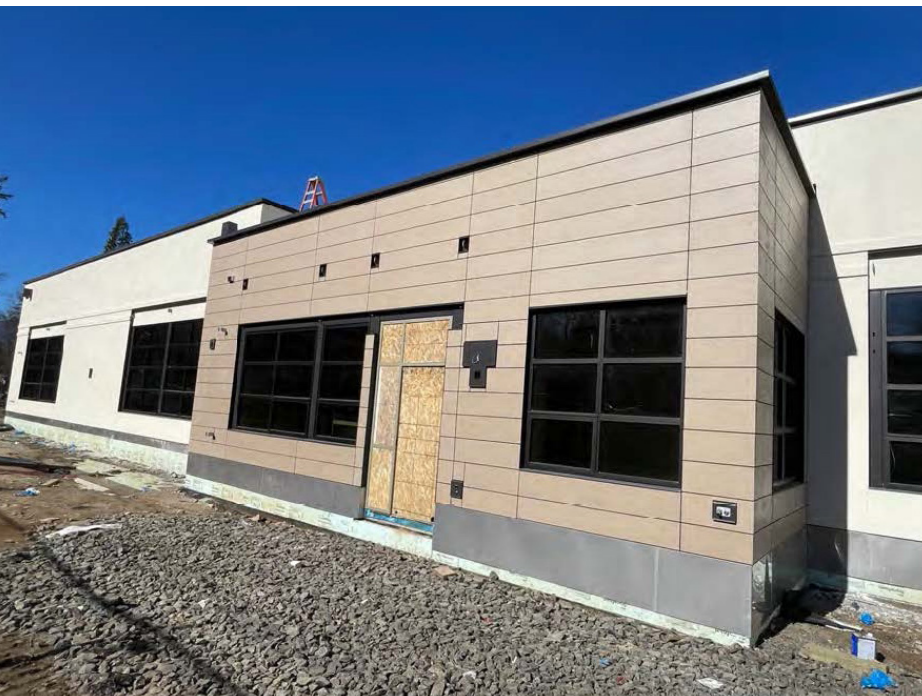
EXTERIOR CEMBRIT CLADDING AND NEW STUCCO AT WALKER ELEMENTARY SCHOOL ADDITION

During the month of February, great progress was made at Ashland High School in moving that project ahead. A Construction Manager|General Contractor (CMGC) was selected and approved by the board. Walker Elementary is rounding the corner and is now weeks away from completion. The Bellview Elementary HVAC project began sourcing some of the long lead items that are needed. Helman Elementary, Ashland Middle School and Trails Outdoor School are all working through the various closeout activities and addressing any punchlist items that are outstanding.