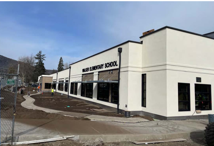
THE NEW BUILDING EXTERIOR WITH SIGNAGE

The exterior of the building is almost complete with full installation of stucco and cembrit panels leaving only a minor amount of paint touch up to complete. Covered steel structures and hand railings have been installed and are being painted. Installation of the playground is under way. Punch walks are one of the final steps of a construction project, allowing the opportunity to ensure that there are no flaws or issues to be addressed.