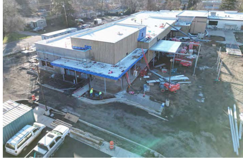
COURTYARD CANOPIES AND FLATWORK

Courtyard work is progressing rapidly with nearly all concrete flatwork complete. Structural steel walkways and canopies are in the final stages of erection. Landscaping has begun to fill parking lot planters, and final steps in retention wall construction is underway. The majority of paint work has been completed and finish work including installation of bathroom tile, ceiling tile, casework, countertops and plumbing/electrical finish is underway. Mechanical, electrical and plumbing are nearly ready for the commissioning process to begin, signifying the nearing of project substantial completion.