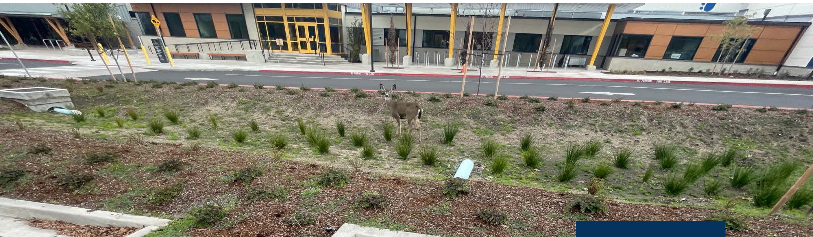
CAMPUS LANDSCAPE ESTABLISHING