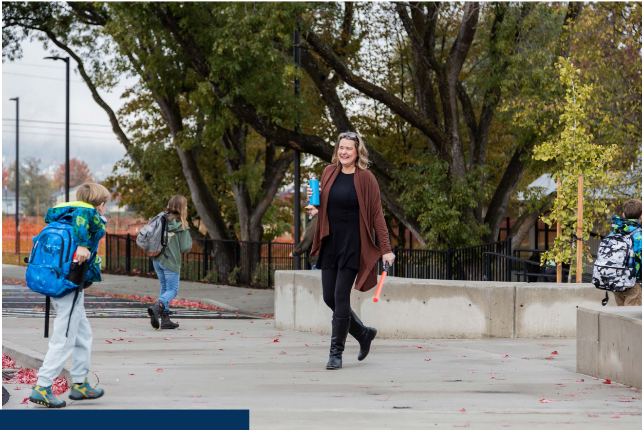
TRAILS FIRST DAY OF SCHOOL