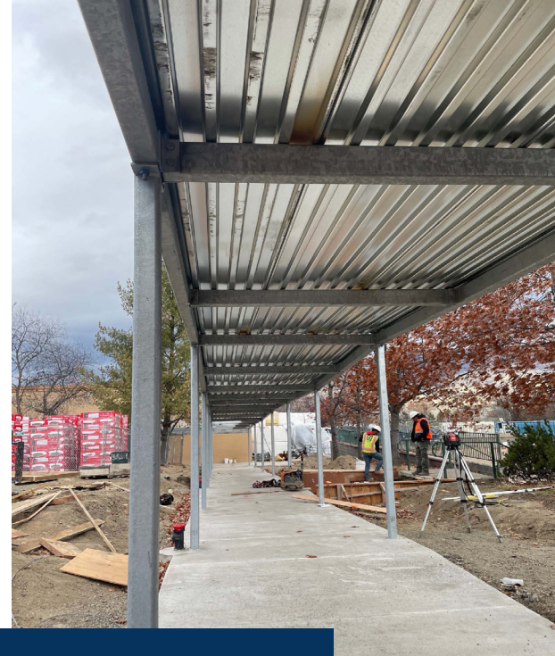
STRUCTURAL STEEL AT COURTYARD COVERED WALKWAYS