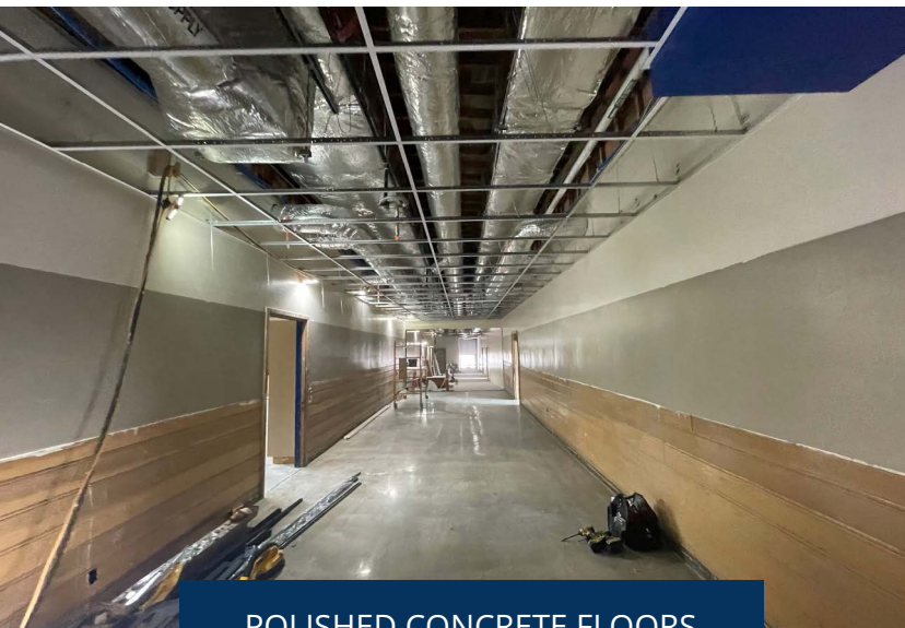
POLISHED CONCRETE FLOORS