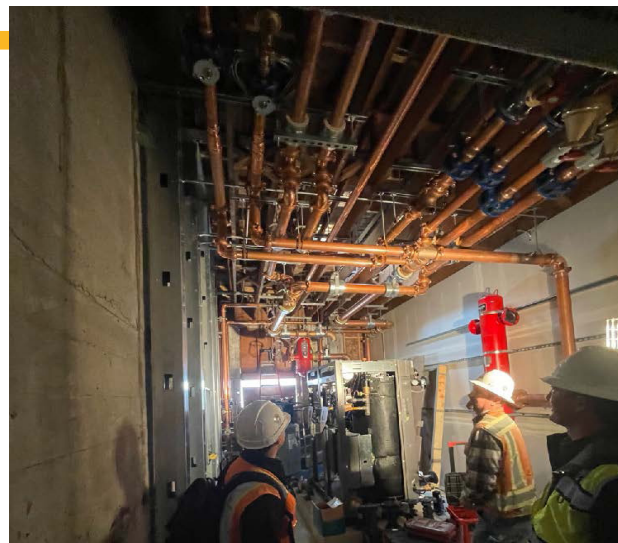
COPPER PIPING IN THE BOILER ROOM