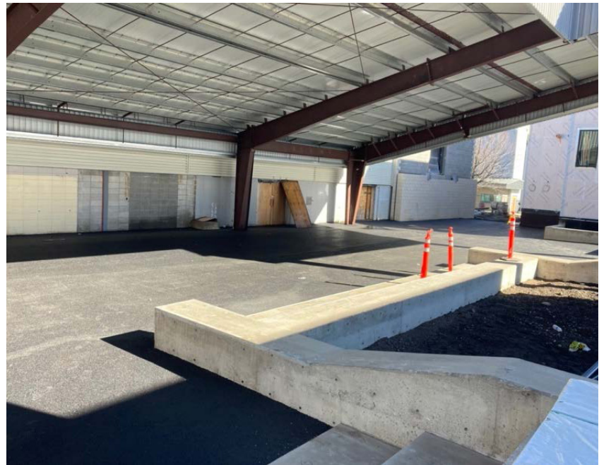
ASPHALT IN THE COURTYARD AT AMS

February was a momentous milestone in the bond program, with students starting the second week of February in the new building at Helman Elementary School. Ashland Middle School and Ashland Outdoor School is continuing to progress through finishes. Ashland High School received the GMP from Gerding Builders and Walker Elementary School's new addition progressed with concrete foundations. Finally, Maintenance and Transportation projects bid and contracts were awarded to Outlier Construction.