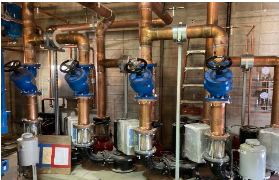
BOILER ROOM AND CHILLER