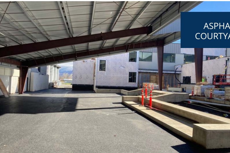
ASPHALT IN THE COURTYARD AT AMS