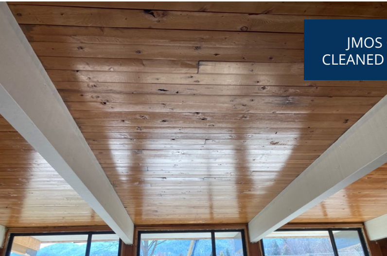
JMOS CEILINGS CLEANED AND SEALED