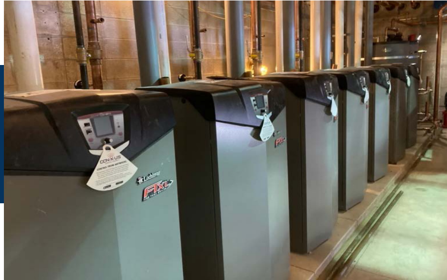
BOILER ROOM AND CHILLER