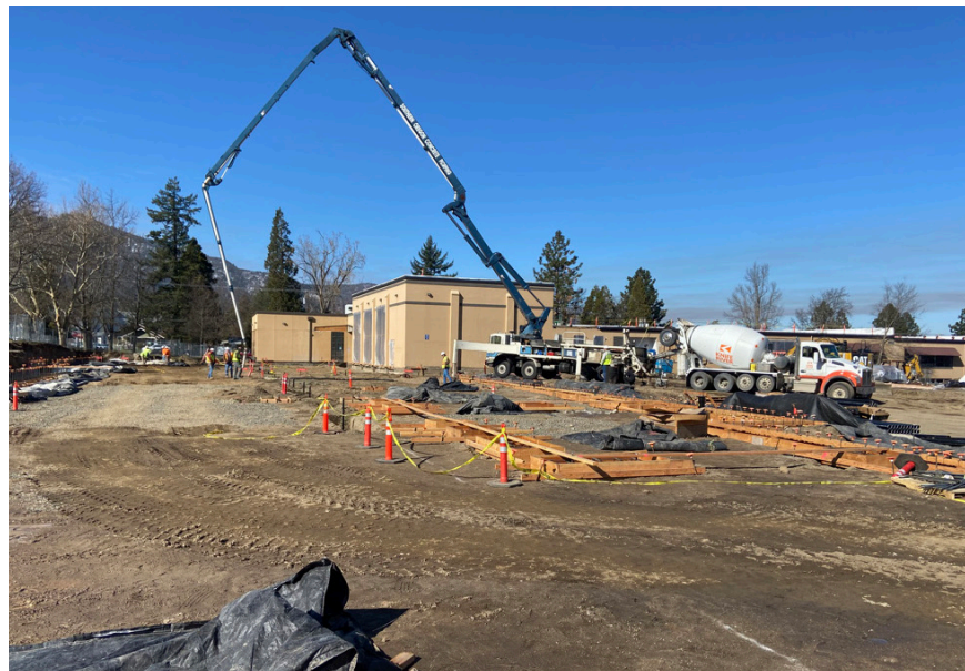
POURING THE CONCRETE NEW ADDITION FOOTINGS