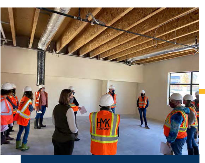
HELMAN STAFF TOURING THE NEW BUILDING